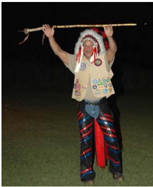
Spirit Guide and Song Stick