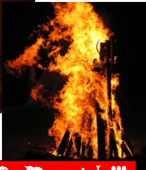
Fire of Death!!!